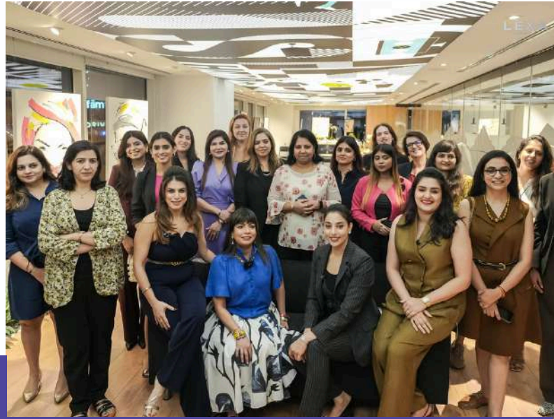
3rd international delegation to Dubai, creating cross-border opportunities for founders