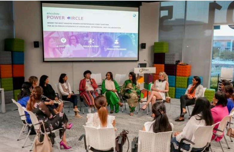
Encubay Power Circles held across Delhi, Mumbai, Pune, Bangalore, Ahmedabad, and Dubai, offering unique networking and upskilling opportunities.