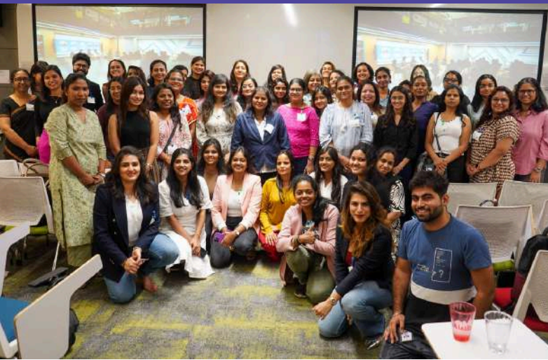
Women in Tech Summit with INDrive offering $30K in grants and partnered | Launch of Google for Developers program across six cities